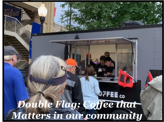
Double Flag: Coffee that Matters in our community