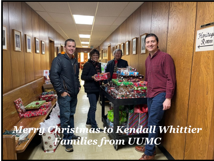
Merry Christmas to Kendall Whittier Families from UUMC