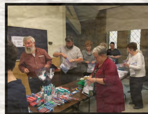
The church worked together...